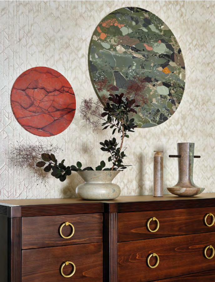
“The result is a timeless and classic backdrop for the contemporary furniture and art in the home”