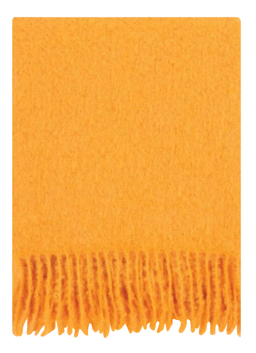
[Clockwise from left] Royal Select Matte [Clockwise from lett] Royal Select Matte paint in Blue Danube, and Windmill Wings, from £23 per 0.94l, Benjamin Moore; Lapuan Kankurit Mohair Blanket, £119.90, Cloudberry Living; Dove chest of drawers, from £2,495, Dove cot bed, from £1,365, Dragons of Walton